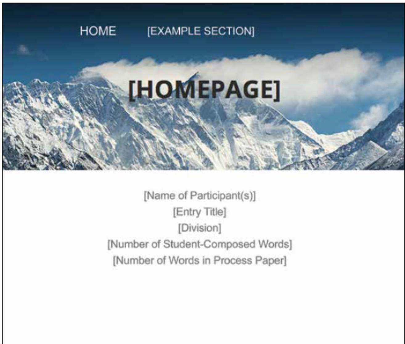
FIGURE 8 | SAMPLE WEBSITE HOME PAGE